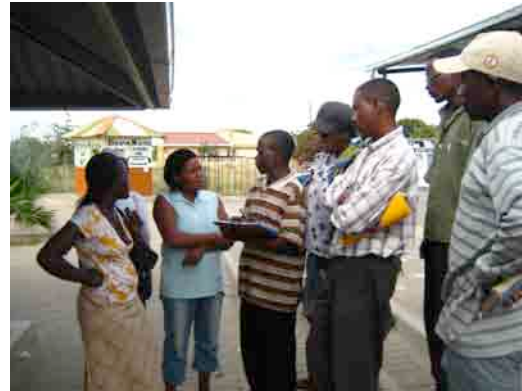
Assessing small businesses at the market in Rundu

An intern from the American Center for Global Education was placed with NHAG and supported NHAG/SDFN with methodologies to collect information on small business activities in Khomas and Kavango regions. The work in the Kavango region involved also members from Zambia, Zimbabwe and Malawi during a national and international exchange.