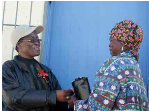
Deputy Minister Mushelenga congratulate a member

55 houses in the City of Windhoek in the Khomas Region: The houses for five of the groups who received land during 2002 were officially opened by the Honourable Theopoline Mushelenga, Deputy Minister of Trade and Industry on behalf of Honourable Kazenambo Kazenambo, Deputy Minister of Regional and Local Government, Housing and Rural Development who could not make it due other commitments. The event was also attended by Councilor Boas Ekandjo (representing the Mayor of the City of Windhoek), senior staff members from Afrisam (the new brand name of Holcim Cement) and Standard Bank, Federation members from Kavango and Khomas, NHAG Staff, SDI Staff, as well as the Brazilian and Angolan delegations.