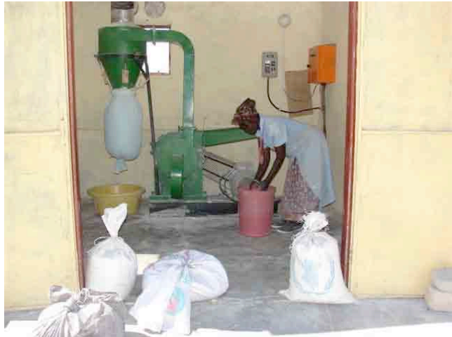
Packing at the Mahangu Mill

A mahangu mill received additional funding from Holcim for an amount of N$10,700. The project is operating as a business within a subsistence farming area and the community aims to create more jobs and contribute to the cultural values. The proposed additional activities included the buying, crushing, packaging, promoting and marketing this traditional staple food of the northern regions in Namibia. Traditional crushing will also take place employing the youth to promote the culture and enable the youth to obtain additional income.