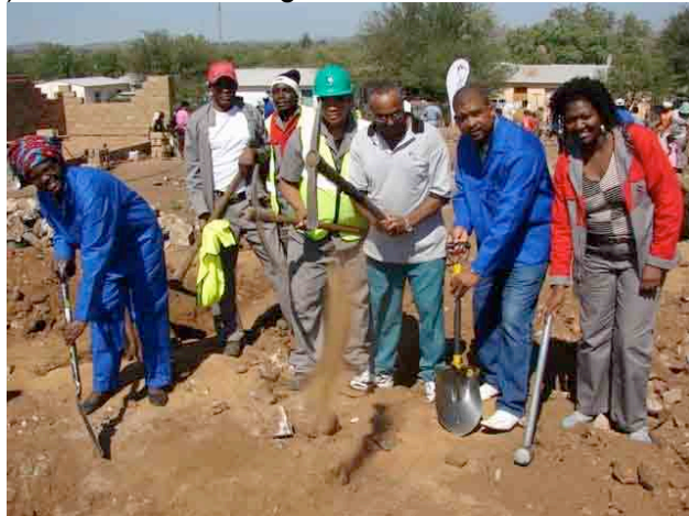
Partners working during Tsumeb Brickmaking Event: Mayors from Eenhana and Tsumeb and Afrisam staff Mayor, Tsum