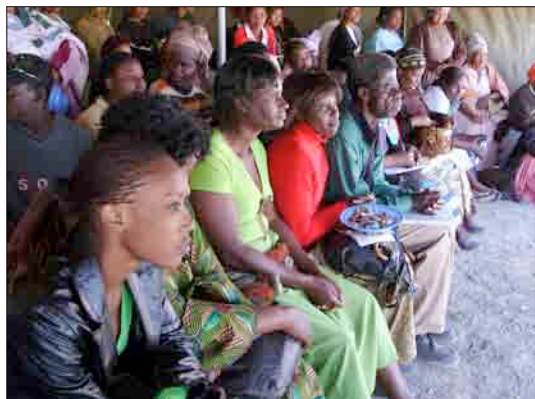
SDI Members from Southern Africa in Tses

Two exchanges were facilitated in Namibia to share experiences on Federation processes in the respective countries in Southern Africa. One focused on leadership structures and more local involvement in federation work and decision making, while the second focused on the management of poor people’s funds.