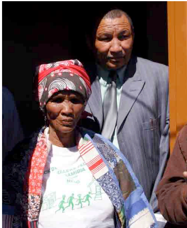
The governor with one of the pensioners at her new house