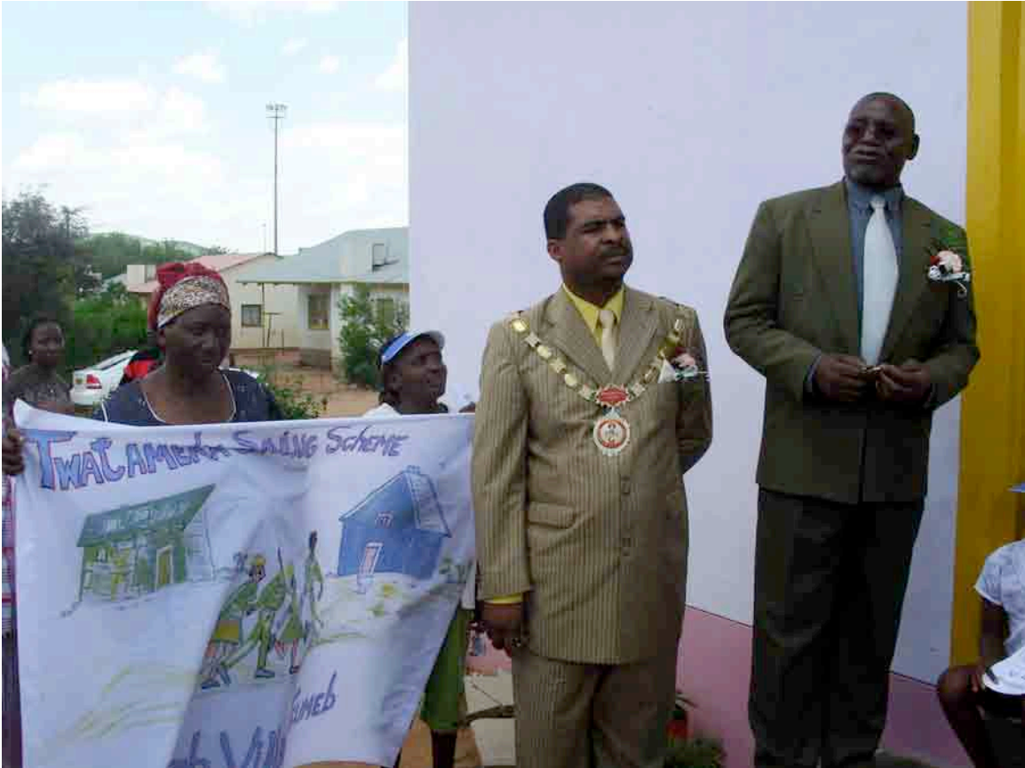
The late Minister Pandeni opening a house in Tsumeb

Twahangana Fund. Their financial donations at that stage totaled N$ 500 000-00. The Late Minister also launched the 25 new houses currently under construction.