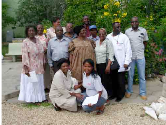
Arandis Town Council and members in Windhoek

Arandis Town Council: An exchange by the Arandis Town Councilors, Staff and saving scheme members to Windhoek took place in March 2008. Following the visits to the communities, the councilors were enthusiastic about the Federation process.