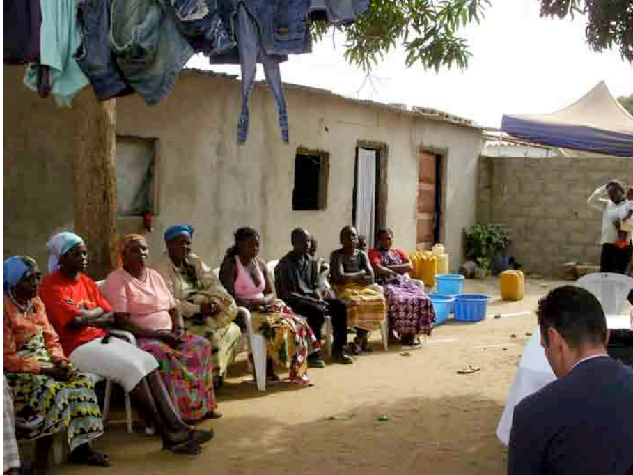
Community members in Luanda sharing experiences with Namibians and Brazilians

Small Business Exchanges: Zimbabweans, Malawians and Zambians participated in the Small Business Review which took place in April in Kavango as part of the strengthening of this activity of the Twahangana Fund. During the exchanges daily savings were also encouraged: