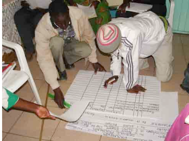
Preparation for the National meeting

The national meeting in January enabled the members to assess their progress in the organization. A decrease in membership with about 2,500 members was experienced; the decrease was a result of a long land delivery process as members became impatient. Kavango is the only region where no SDFN houses were constructed. However other regions did grow in terms of savings and members and the leadership in all regions are expanding.