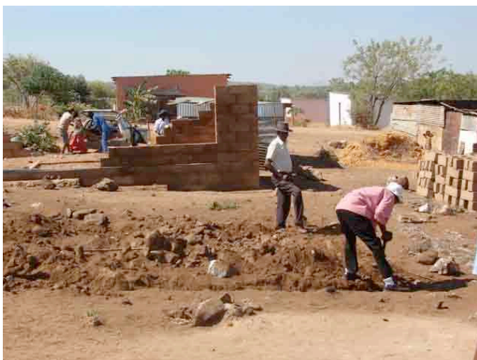
Tsumeb: new excavations for the latest phase

Land and Service Projects are ongoing in 17 locations in 10 of the regions on an incremental basis. The project in Ondjozondjupa is one of the first extensive rural housing programs in Namibia.